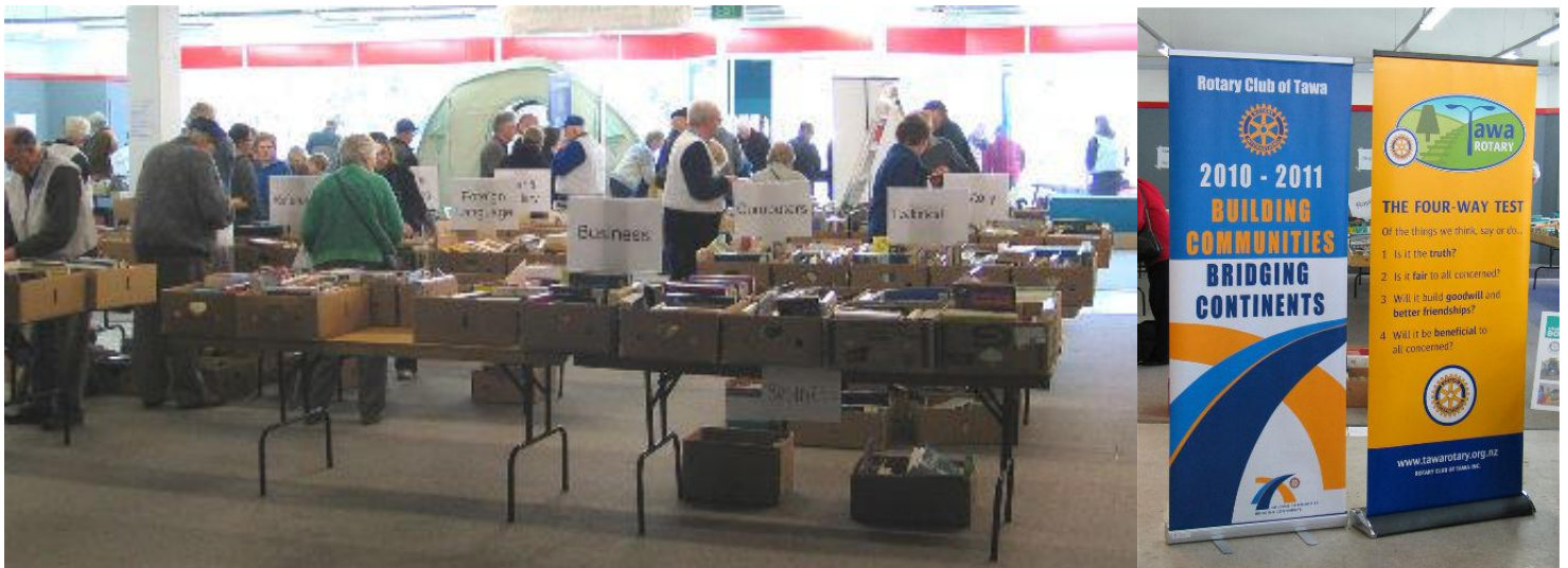
A selection of photos from Day 1 of the Book Fair